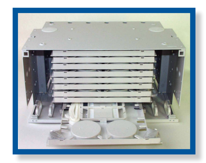
Universal Splice Bay

*Call your FiberSource Representative for cable type availability. Some variations may have limited availability or may be subject to minimum order quantity requirements.